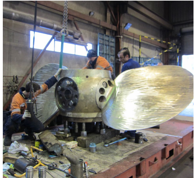
Propeller hub rebuild – Trawler Irvinga