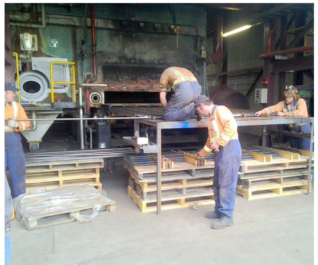
Coal fired grate overhaul in progress