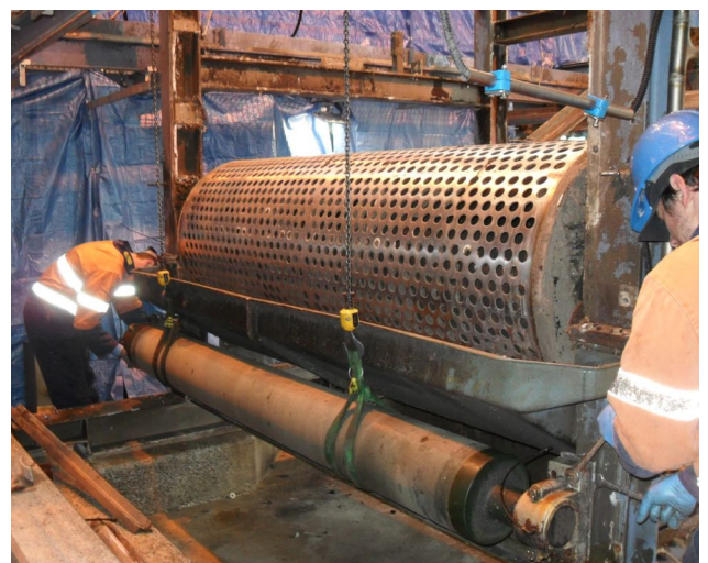
Sludge press overhaul – Waste Water Plant